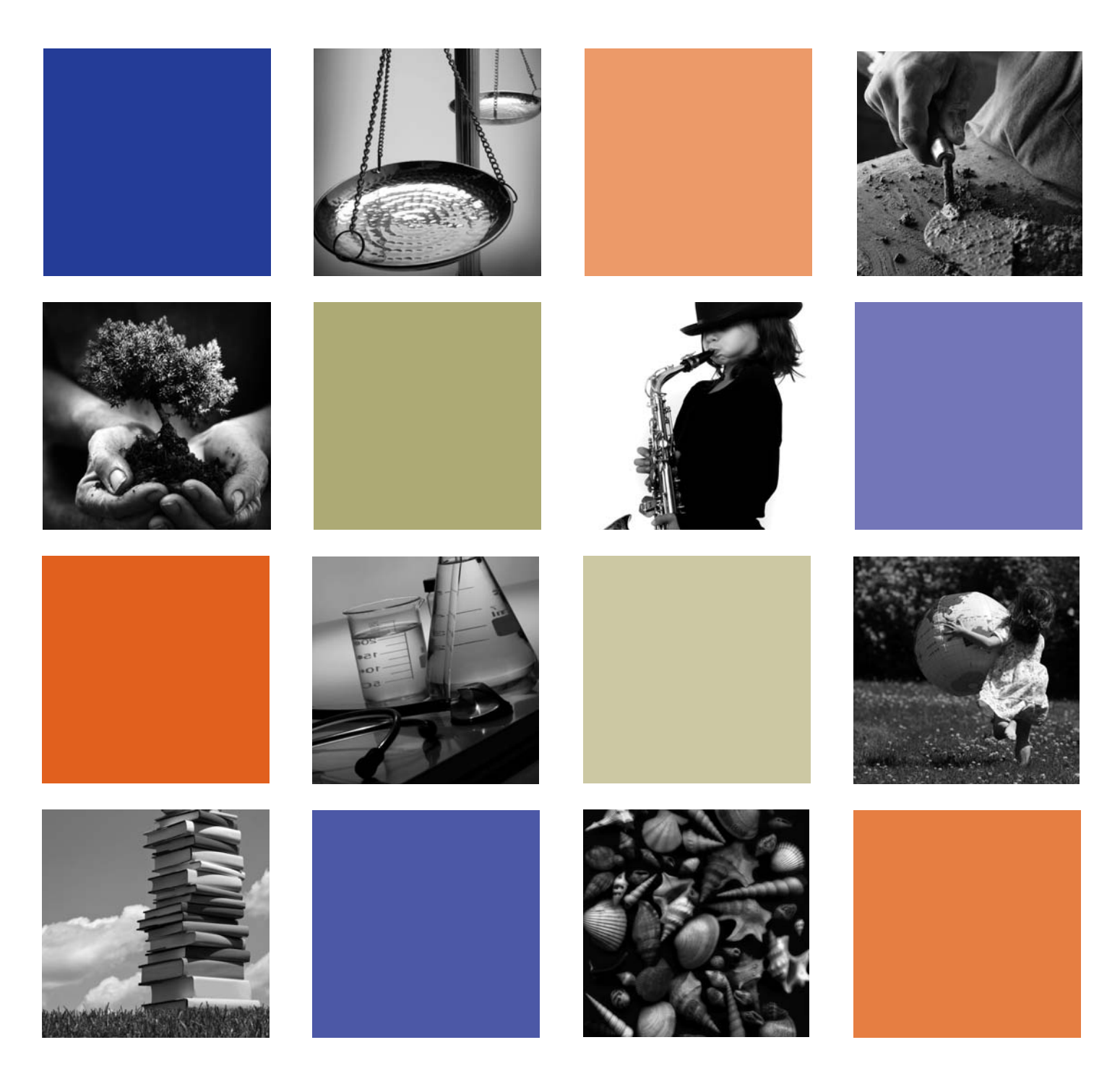
REVIEW OF FOUNDATION CONTRIBUTIONS