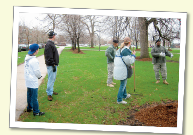
Kirkland volunteers learn how to mulch trees with Friends of the Parks.