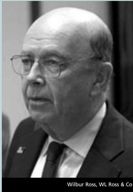
Wilbur Ross, WL Ross & Co