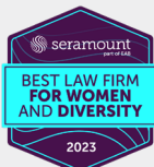
Best Law Firms for Women 2011–2023

Read more about our women's leadership initiatives , racial/ethnic diversity initiatives and client & community partnerships .