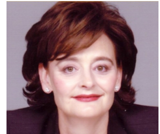
Cherie Booth Blair addresses Kirkland's Women's Leadership Forum