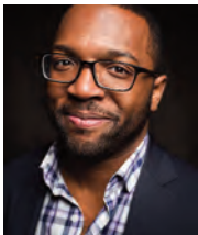
Baratunde Thurston