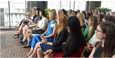
The New York WLI hosted its fifth annual Women's Symposium in July 2018.