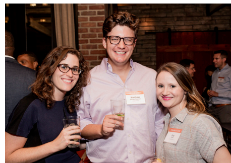
More than 45 attorneys attended the LGBT Bar Association's Lavender Law Conference & Career Fair and related Kirkland events, including a cocktail reception for clients, prospective clients and alumni, in August 2018.