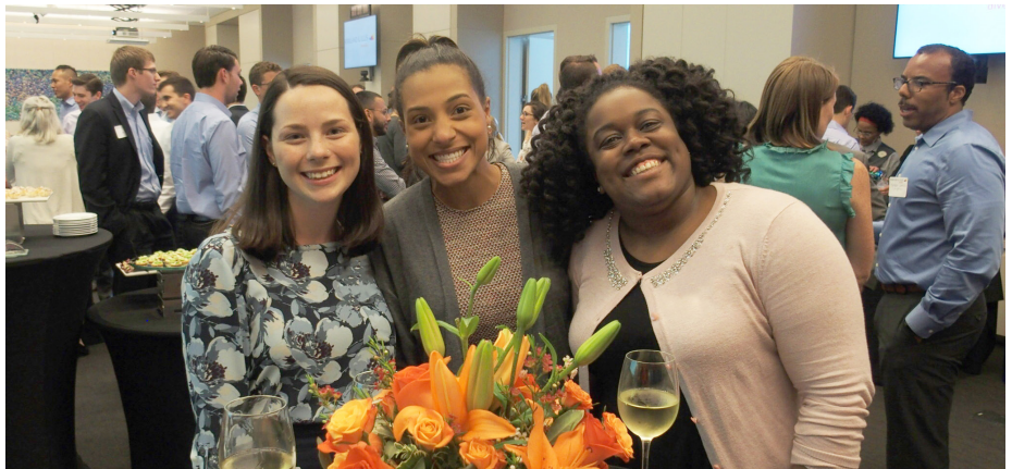
Summer associates across the U.S. attended a Firmwide Diversity and Inclusion Overview in May 2018.