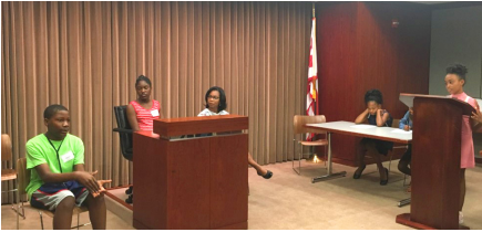
Students from Higher Achievement participated in a mock trial in July 2018.