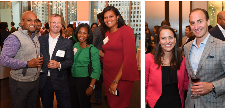
Attorneys gathered for a cocktail reception during the All Partner Meeting in October 2018.