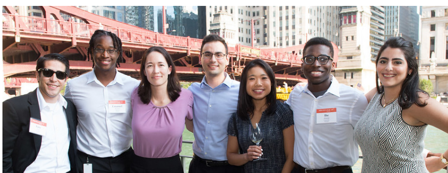
More than 140 Kirkland leaders and summer associates attended the Diversity Summer Networking Program in July 2018.

one of 21 law firms recognized as both a Top Performer and Compass Award winner.